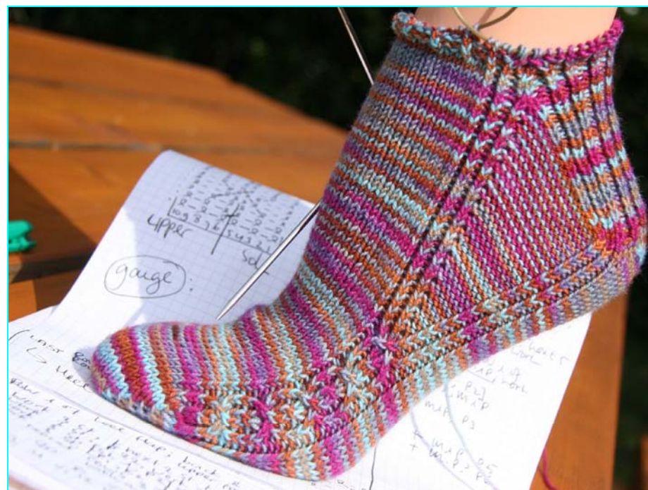
Blue Moon Fiber Artists, Socks That Rock

I have included separate, detailed instructions for the provisional crochet cast-on-toe and the technique ‘ cabling without a cable needle ’. Easily mastered, this skill will save huge amounts of time.