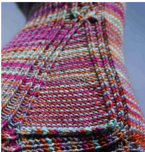
The Firestarter Gusset